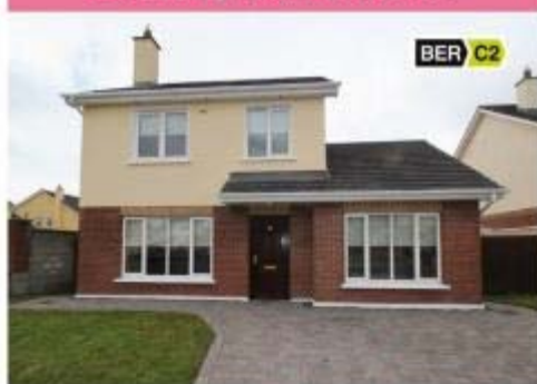
33 Agh Na Hara, Stradbally Rd, Portlaoise

3 Bed / 3 Bath Semi-Detached House €189,000