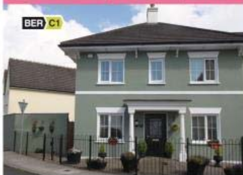
70 Hawthorne Way Esker Hills, Portlaoise, Laois

3 Bed / 3 Bath Semi-Detached House €189,000