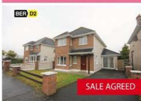
39 Dunmasc, Dublin Rd, Portlaoise

4 Bed / 3 Baths Semi-Detached House €229,000