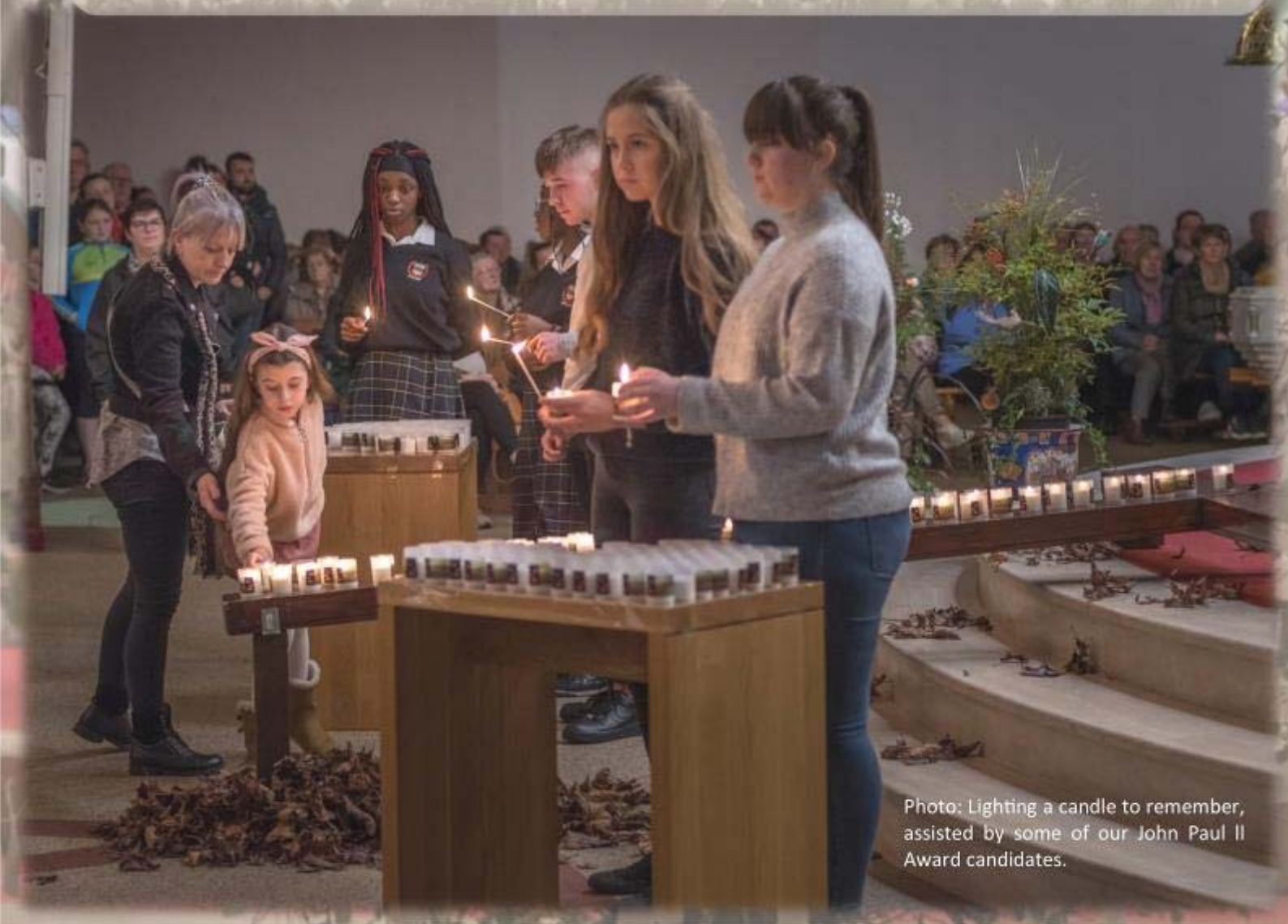
Photo: Lighting a candle to remember, assisted by some of our John Paul II Award candidates.

We thank all who made our annual Bereavement Mass celebrated last Monday evening so special. We remembered over 140 people who died during the past year - 102 Requiems celebrated in our Parish and other Portlaoise people and relatives and friends. More photos on pages 22-23.