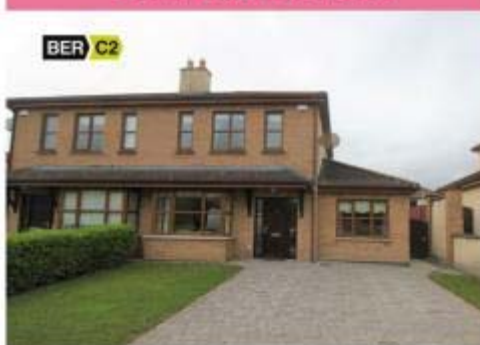
16 Rathevan View, Borris Rd, Portlaoise

4 Bed / 3 Baths Semi-Detached House €229,000