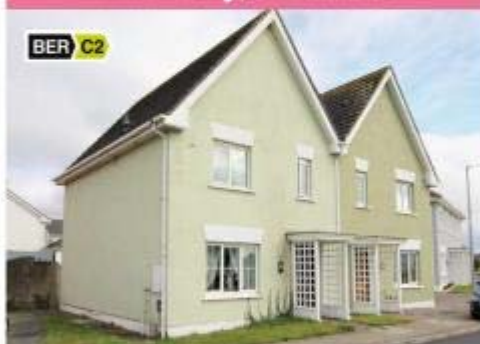
15 Lakeside Gardens, Kilminchy, Portlaoise

3 Bed Semi-Detached with Garage €169,000