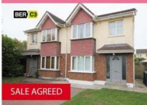
19 Triogue Manor, Portlaoise

3 Beds / 3 Baths Semi-Detached House €165,000