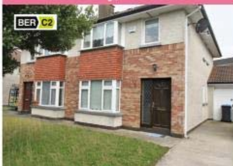
6 Castle Way, Kilminchy, Portlaoise

3 Bed Semi-Detached with Garage €169,000