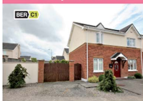
1 Agh Na Hara, Stradbally Rd, Portlaoise

4 Bed / 3 Baths Semi-Detached House €229,000