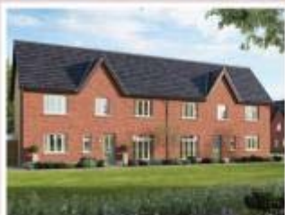
THE KELLS 3 Bed Semi Detached

Luxurious Finishes • Prestigious Location • From the Developers of Foxburrow