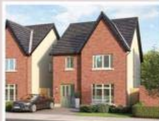
THE CASHEL 3 Bed Detached