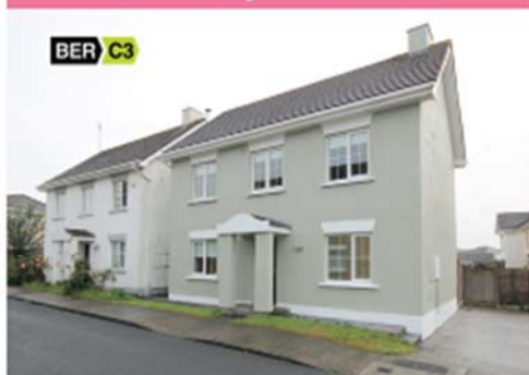
9 Lake Edge, Kilminchy, Portlaoise

3 Bed / 3 Baths Semi-Detached House €170,000