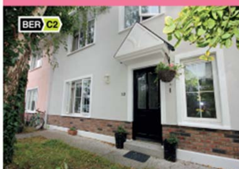
10 The Hermitage, Borris Rd, Portlaoise