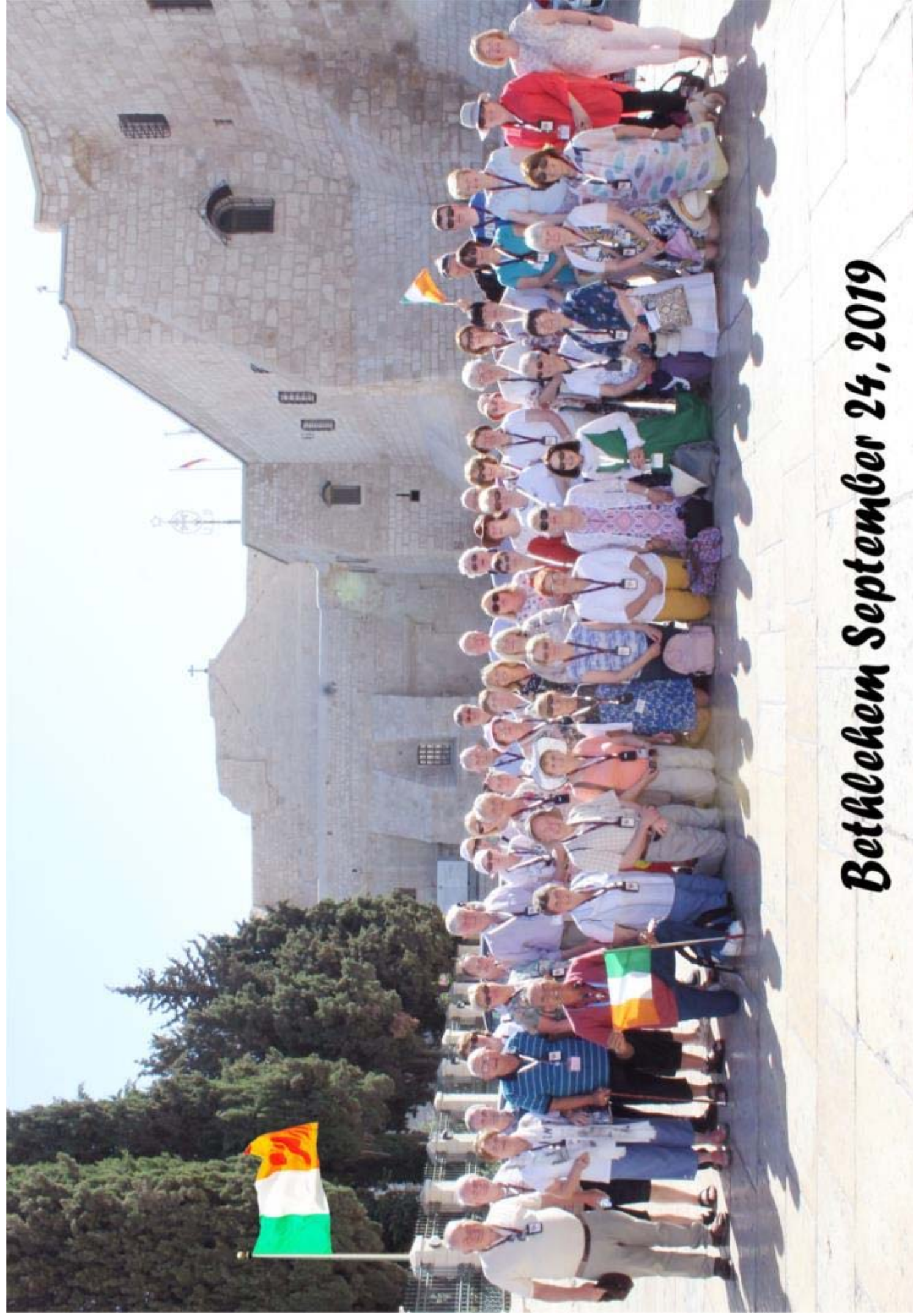
Bethlehem September 24, 2019