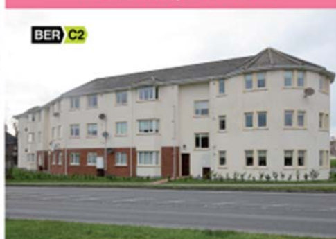
5 Bridle Walk, Dublin Rd, Portlaoise, Co. Laois

2 Beds / 2 Baths Ground Floor Apartment €120,000