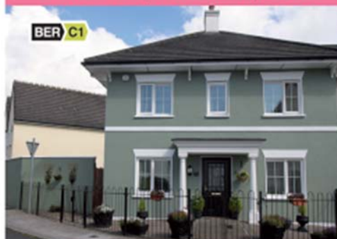
70 Hawthorne Way Esler Hills, Portlaoise, Laois

3 Bed / 3 Bath Semi-Detached House €189,000