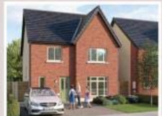
THE ARDGAH 4 Bed Detached