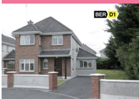
37 Dunmasc, Dublin Rd, Portlaoise