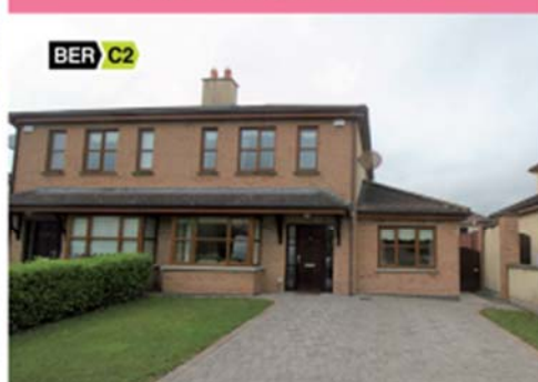
16 Rathevan View, Borris Rd, Portlaoise

4 Bed / 3 Baths Semi-Detached House €229,000