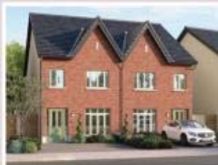
THE AVOCA 3 Bed Semi Detached