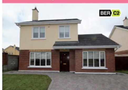
33 Agh Na Hara, Stradbally Rd, Portlaoise

3 Bed / 3 Bath Semi-Detached House €189,000