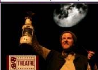
TOM CREAN ANTARCTIC EXPLORER Sat 26 Oct | 8pm | €18/16/60