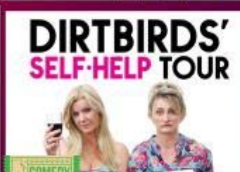
DIRTBIRDS' SELF-HELP TOUR Back by popular demand! Sat 5 Oct | 8pm | €20/€18