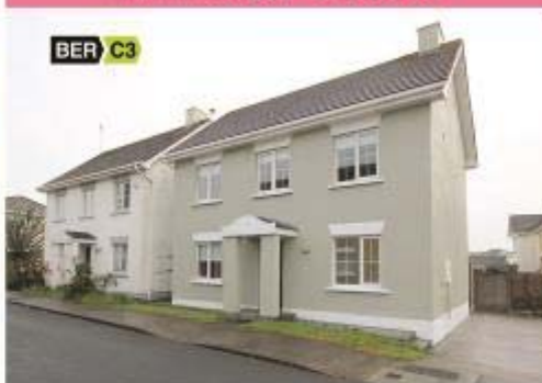
9 Lake Edge, Kilminchy, Portlaoise

3 Bed / 3 Baths Semi-Detached House €170,000