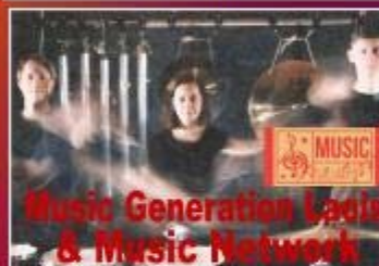
BANGERS & CRASH Percussion Group Tue 8 Oct | 7pm | €15/10