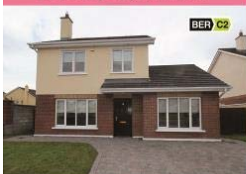
33 Agh Na Hara, Stradbally Rd, Portlaoise

3 Bed / 3 Bath Semi-Detached House €189,000