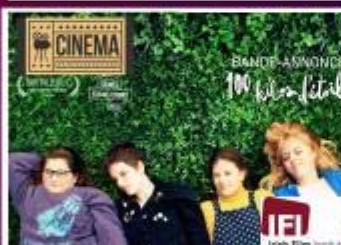
Cinema 4 Schools STARS BY THE POUND Fri 18 Oct | 11am | €5