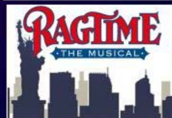
RAGTIME THE MUSICAL Portlaoise Musical Society 16-23 Nov | €18/€15 BOOK EARLY!