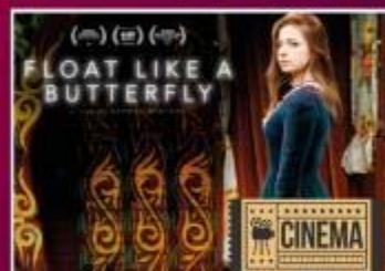
D CINEMA Wed 16 Oct | 8pm | €7/5