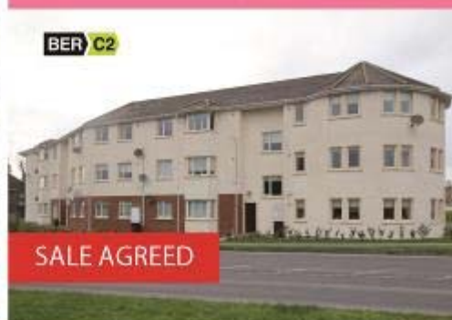
5 Bridle Walk, Dublin Rd, Portlaoise, Co. Laois

2 Beds / 2 Baths Ground Floor Apartment €120,000