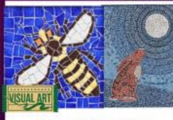
MOSAIC MAKING A one day workshop! Sat 5 Oct | 10am | €95