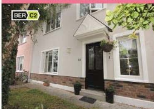
10 The Hermitage, Borris Rd, Portlaoise