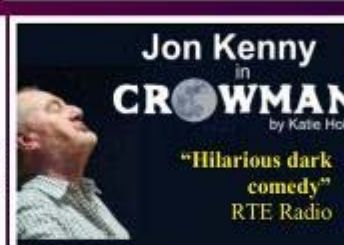
CROWMAN Thurs 10 Oct | 8pm | €20