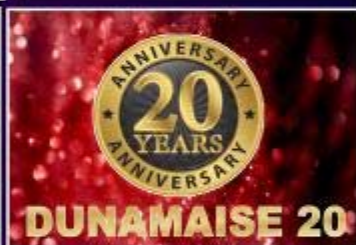
DUNAMAISÉ 20 Special Anniversary Show Sat 19 Oct | 8pm | €15/€12