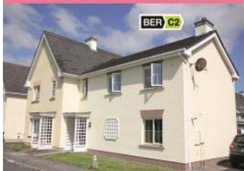
18 Lakeside Gardens, Kilminchy Portlaoise

3 Bed / 3 Baths Semi-Detached House €170,000