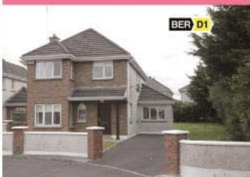
37 Dunmasc, Dublin Rd, Portlaoise