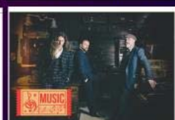
cua New Album Launch Fri 11 Oct | 8pm