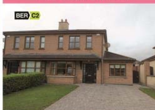
16 Rathevan View, Borris Rd, Portlaoise

4 Bed / 3 Baths Semi-Detached House €229,000