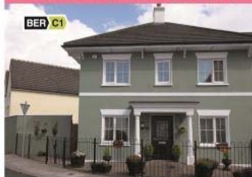
70 Hawthorne Way Esker Hills, Portlaoise, Laois

3 Bed / 3 Bath Semi-Detached House €189,000