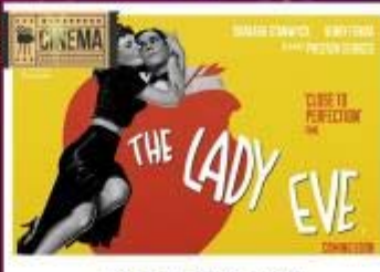
THE LADY EVE Classic Movies at Dunamaisé Tues 1 Oct | 11am | €6/€5