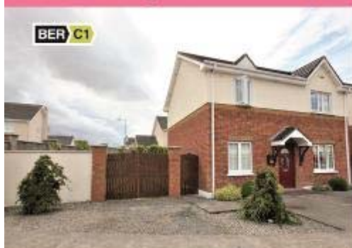
1 Agh Na Hara, Stradbally Rd, Portlaoise

4 Bed / 3 Baths Semi-Detached House €229,000