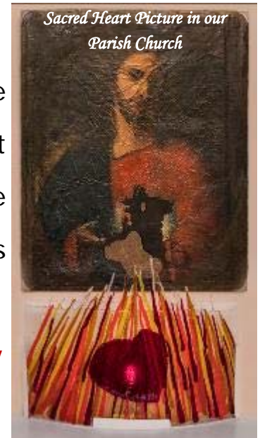
Sacred Heart Picture in our Parish Church

"God so loved the world, that He gave His only begotten Son". (Jn 3:16)