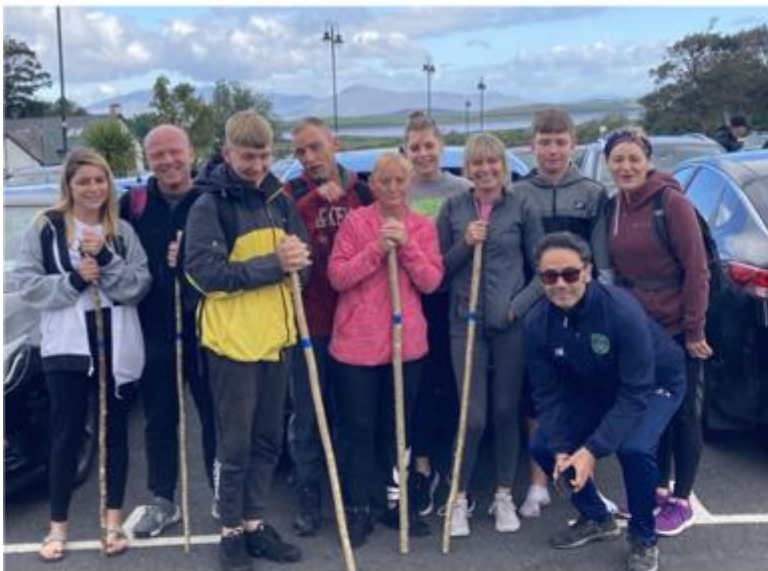
The full group of pilgrims before climbing Croagh Patrick.