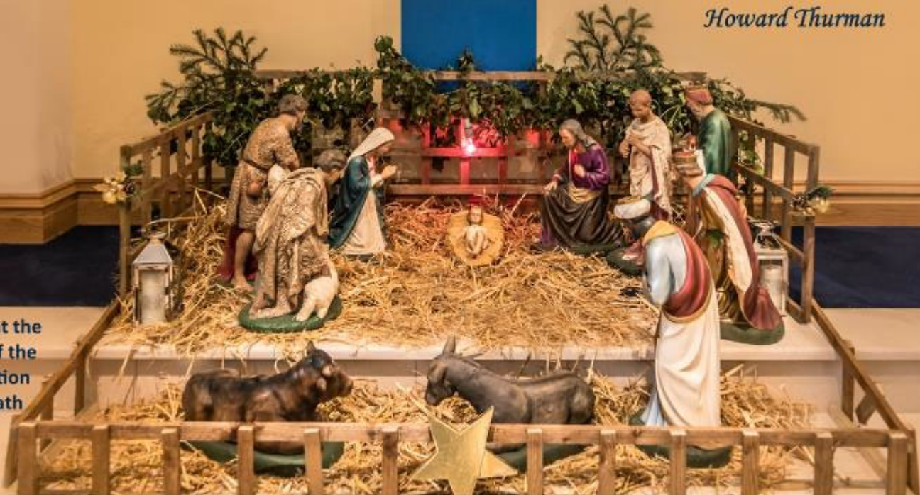
The Crib at the Church of the Assumption The Heath

The Parish Centre 057 8621142 E-mail: info@portlaoiseparish.ie