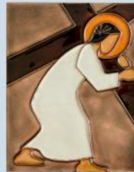
The carrying of the Cross