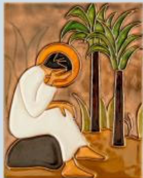
The Agony in the Garden