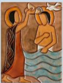
The Baptism in the Jordan