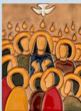
The Descent of the Holy Spirit