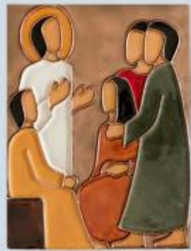
The Proclamation of the Kingdom