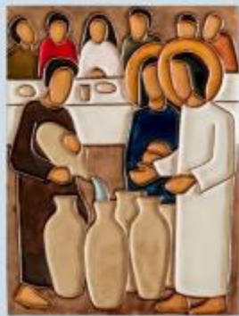
The Wedding feast of Cana