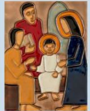
The finding in the Temple