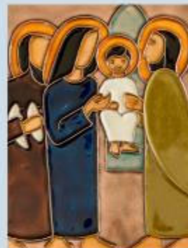
The Presentation in the Temple