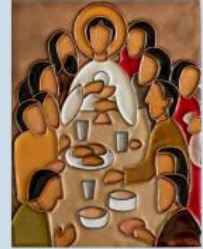
The Institution of the Eucharist