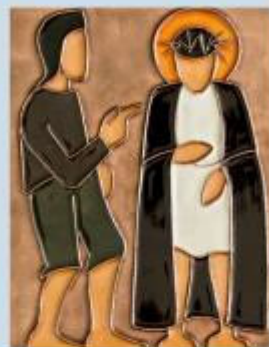
The Crowning with thorns