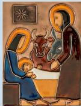
The Birth of Our Lord