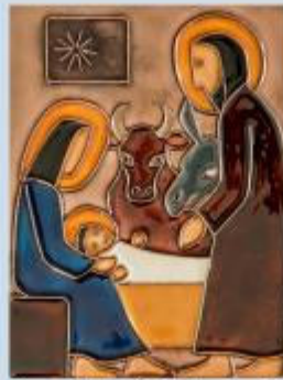
The Birth of Our Lord