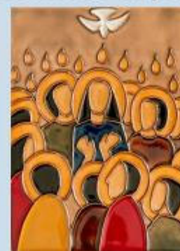
The Descent of the Holy Spirit