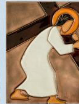
The carrying of the Cross