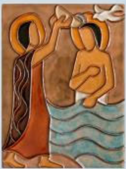
The Baptism in the Jordan