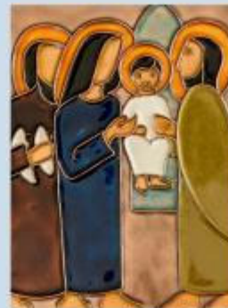
The Presentation in the Temple