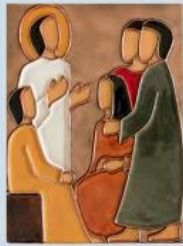
The Proclamation of the Kingdom