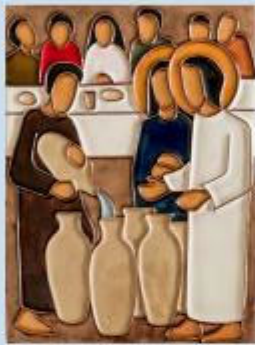
The Wedding feast of Cana