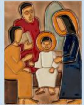
The finding in the Temple