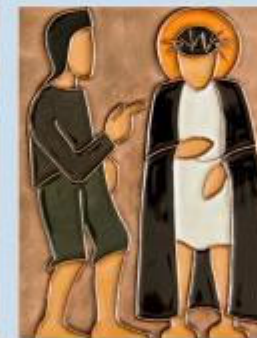
The Crowning with thorns