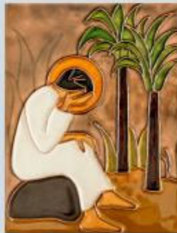
The Agony in the Garden