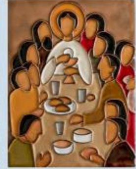
The Institution of the Eucharist