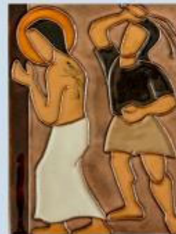
The Scouring at the Pillar