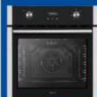
SERVIS BUNDLE FAN OVEN & TOUCH HOB ONLY: €379.00