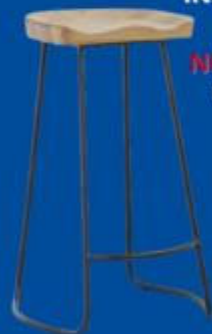
INDUSTRY BAR STOOL