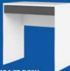
COMPACT DESK GREY/WHITE