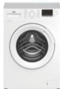
BEKO 9KG WASHING MACHINE ONLY: €329.00

ADD 5 YEAR EXTENDED WARRANTY FOR ONLY €399.00