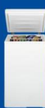
BEKO CHEST FREEZER