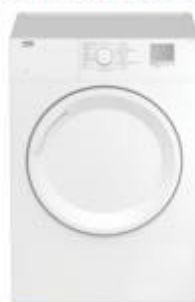
BEKO 8KG VENTED DRYER ONLY: €199.00