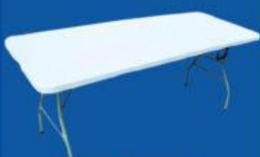
1.8M HEAVY DUTY FOLDING TABLE