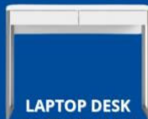
LAPTOP DESK WHITE HIGH GLOSS