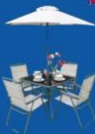
HEATHER 6 Piece

*DISPLAY MODEL NOW: €149.00 WAS: €229.99