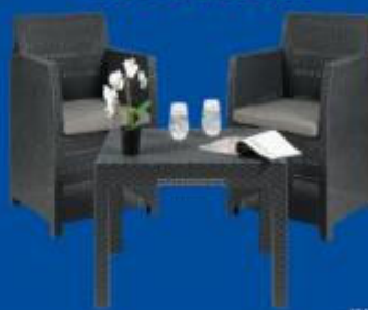
LAVINIA 2 SEATER ONLY: €199.00