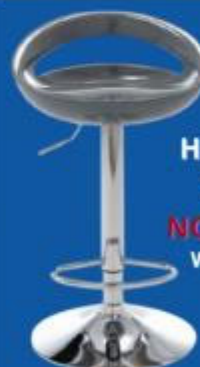
HALO BAR STOOL