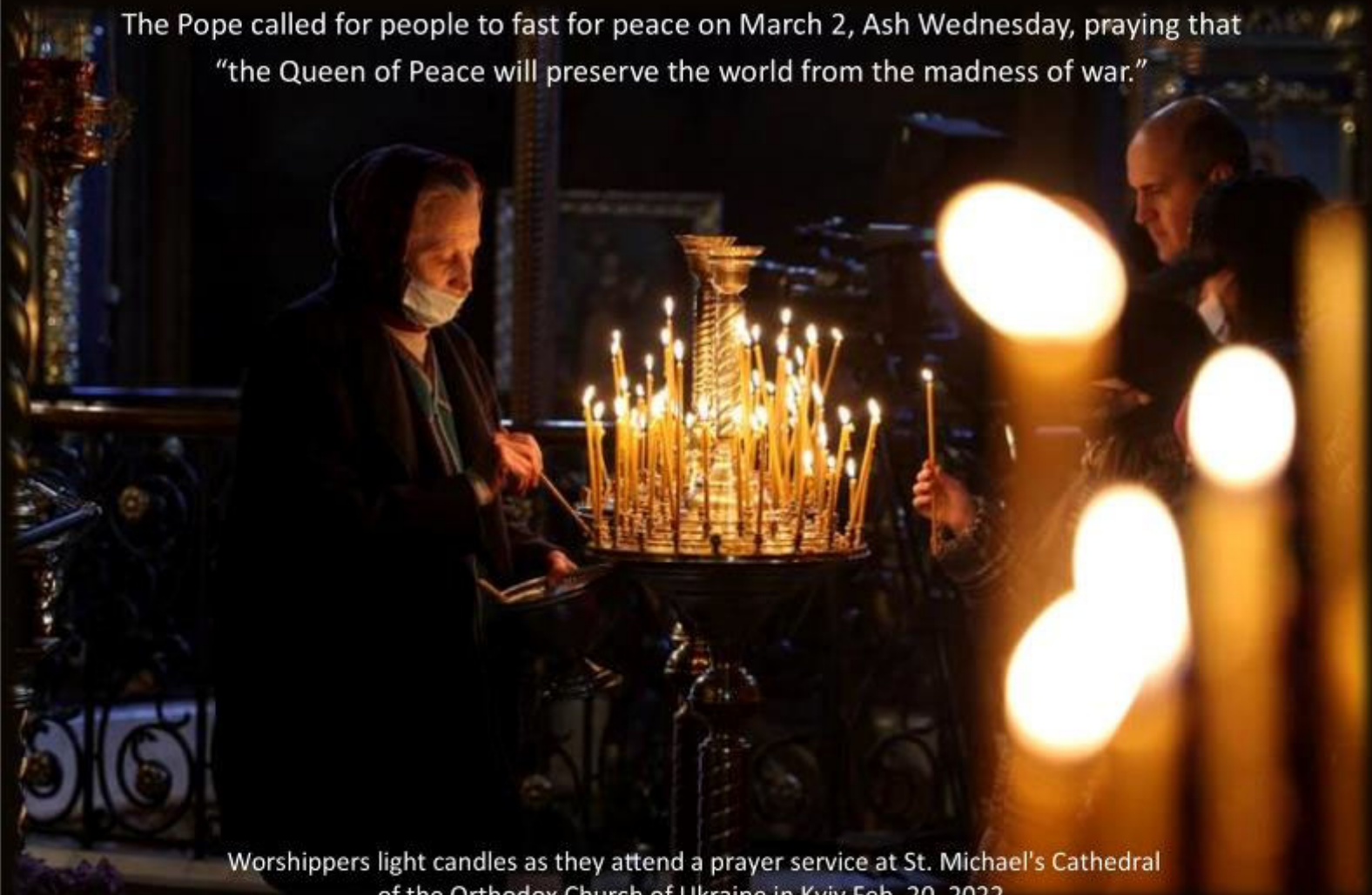
Worshippers light candles as they attend a prayer service at St. Michael's Cathedral of the Orthodox Church of Ukraine in Kyiv Feb. 20, 2022.

The Pope called for people to fast for peace on March 2, Ash Wednesday, praying that "the Queen of Peace will preserve the world from the madness of war."