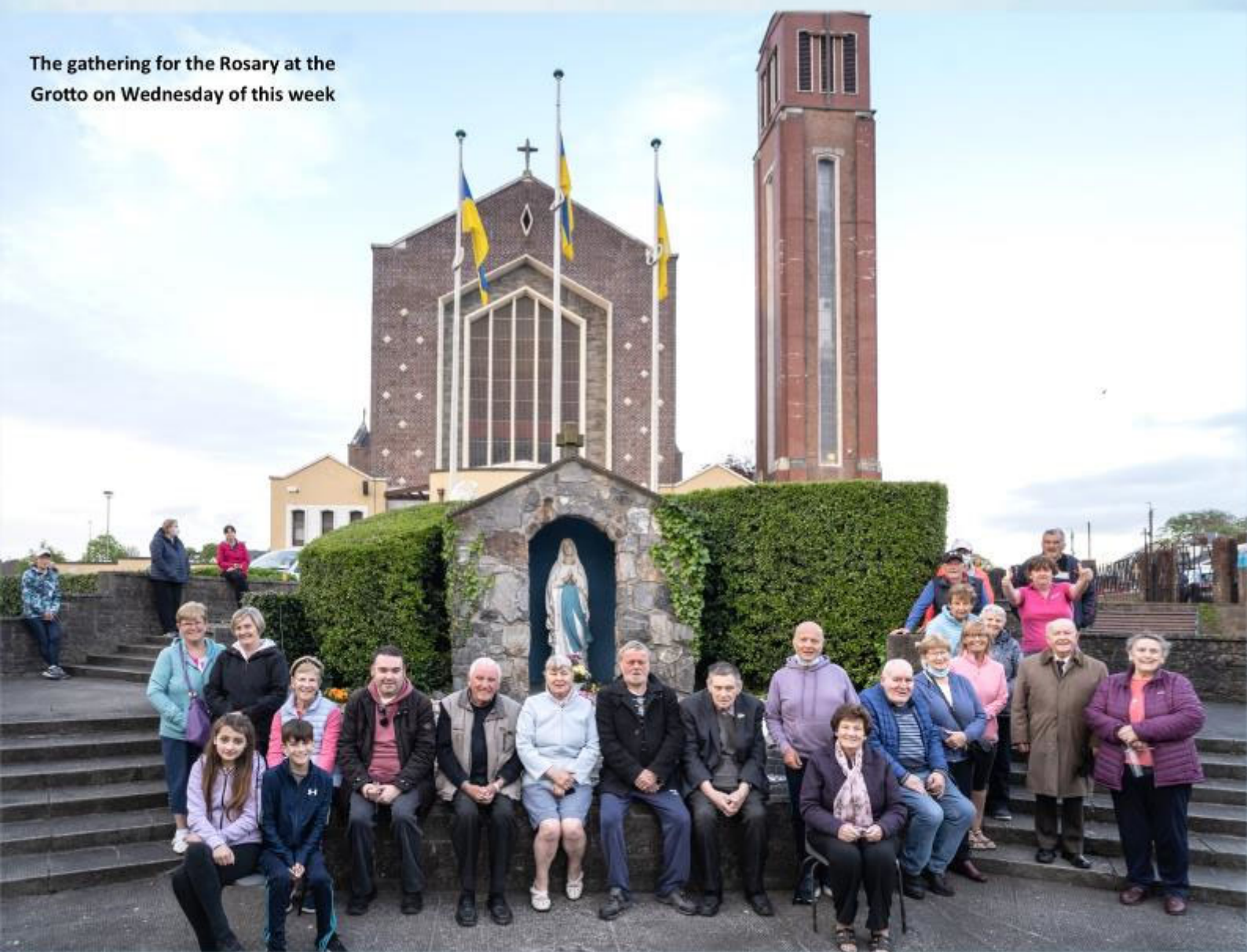
The gathering for the Rosary at the Grotto on Wednesday of this week

The Parish Centre 057 8621142 E-mail: info@portlaoiseparish.ie