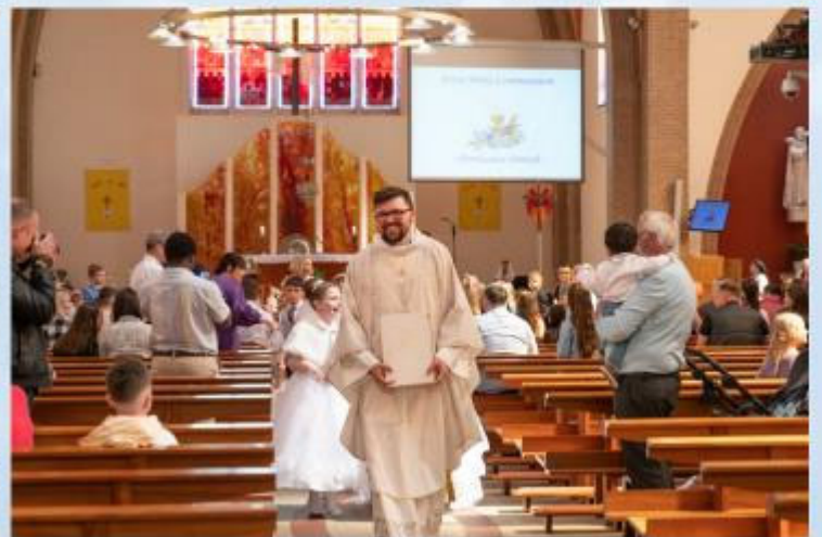
See more photos on our website www.portlaoiseparish.ie/galleries/