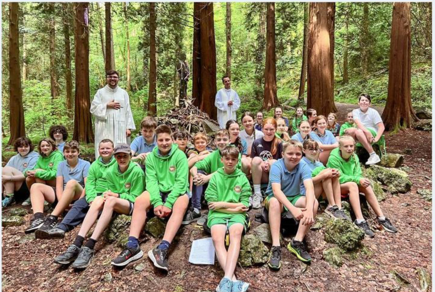
Ratheniska 6 th Class Graduation Mass which was celebrated on Tuesday 13 th June in Stradbally Woods Mass Rock.