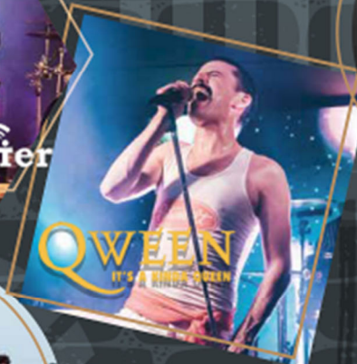
QWEEN IT'S A HARD SCENE