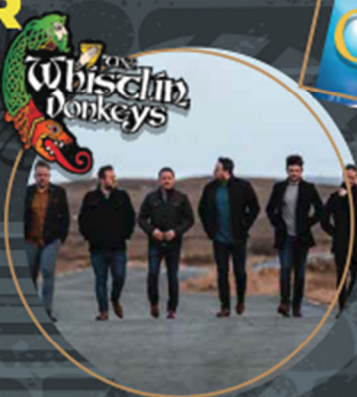
THE Whistlin Donkeys