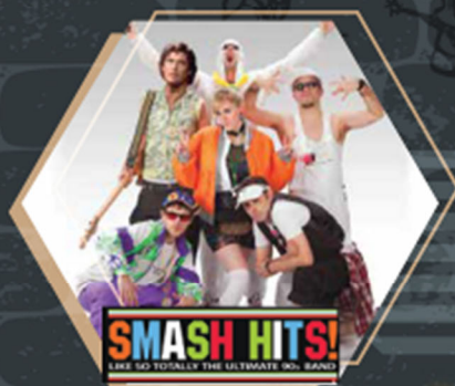
SMASH HITS! LIKE SO TOTALLY THE ULTIMATE 90s BAND