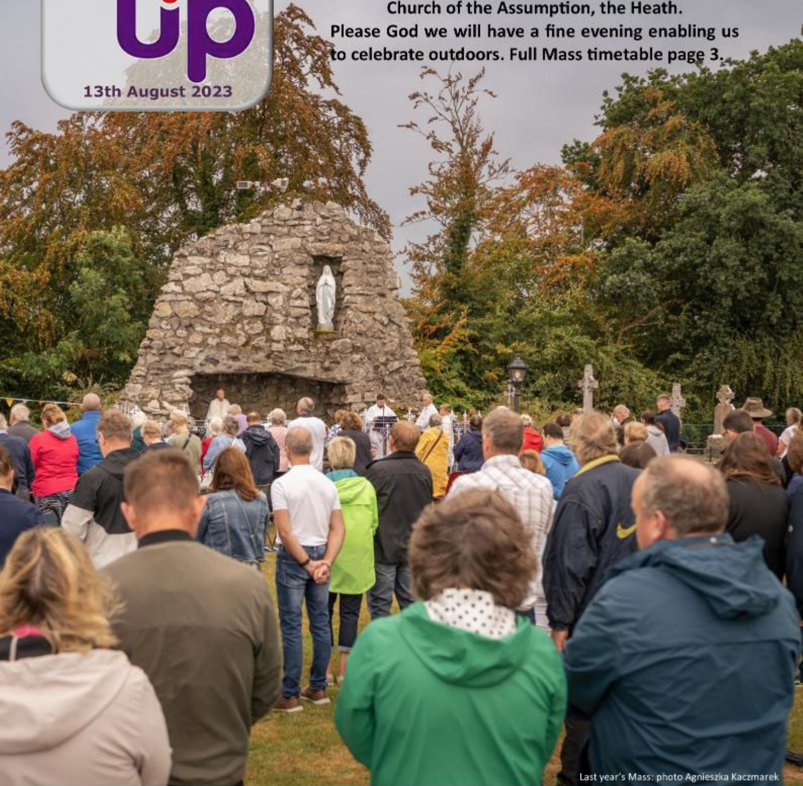
Last year's Mass: photo Agnieszka Kaczmarek

Tuesday next, 15th August, Cemetery Mass at the Church of the Assumption, the Heath. Please God we will have a fine evening enabling us to celebrate outdoors. Full Mass timetable page 3.