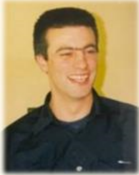
Gavin Young London & Newpark

Even though I walk through the darkest valley, I fear no evil; for you are with me; Your rod and your staff - they comfort me.