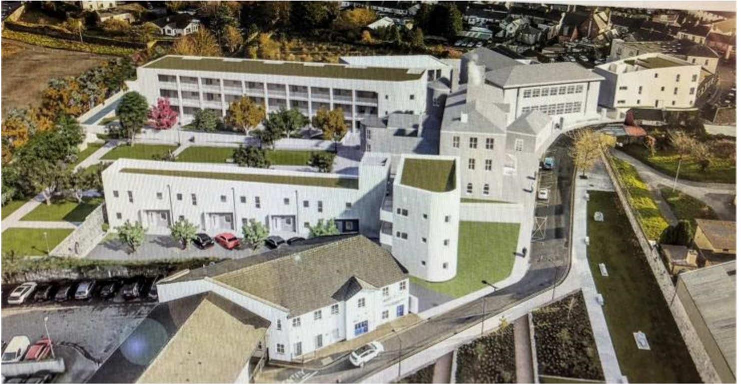
Model of new housing project