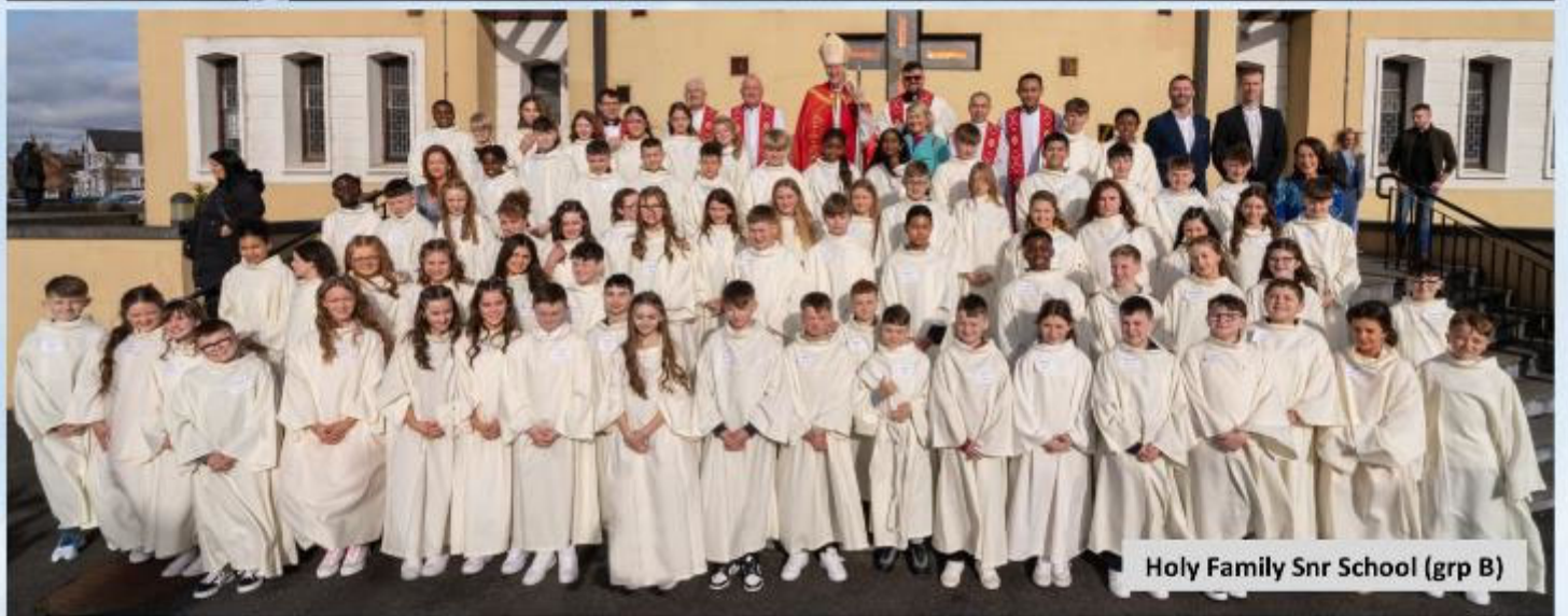
Holy Family Snr School (grp B)