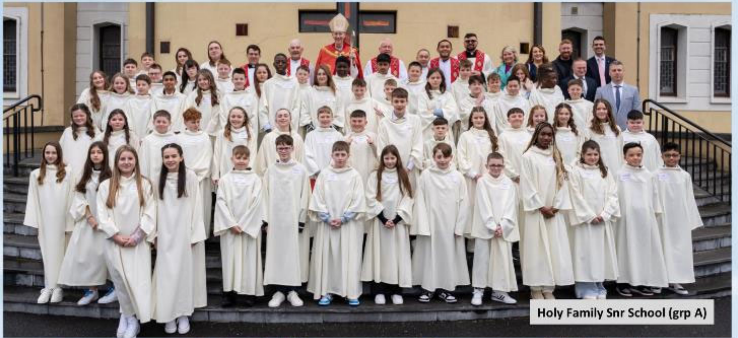
Holy Family Snr School (grp A)