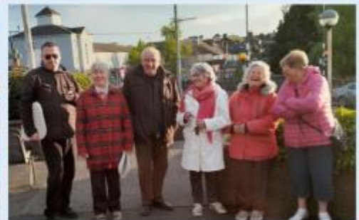
Group of Parishioners enjoying the Rosary at the Grotto for the Month of May