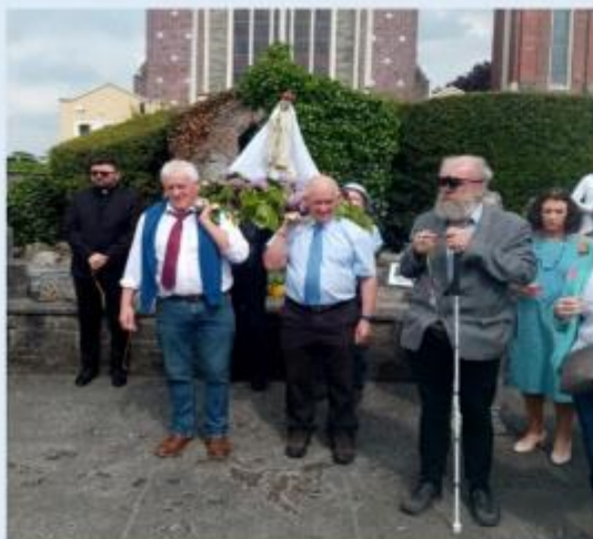
Parishioners leaving the Church grounds to commence the procession to Our Lady through the town to the Top Square where the Rosary was recited in honour of Our Lady of Fatima