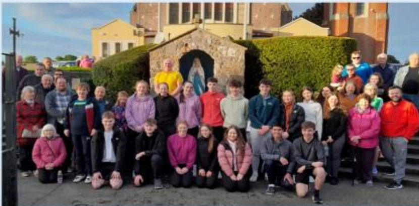
Lourdes Group enjoying the Rosary recited for the month of May at the Grotto at St. Peter & Pauls Church, Portlaoise at 8pm