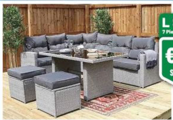
L Seater 7 Piece Furniture Set