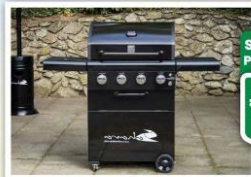
Sahara A450 Performer BBQ