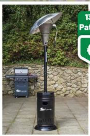
13kw Gas Patio Heater