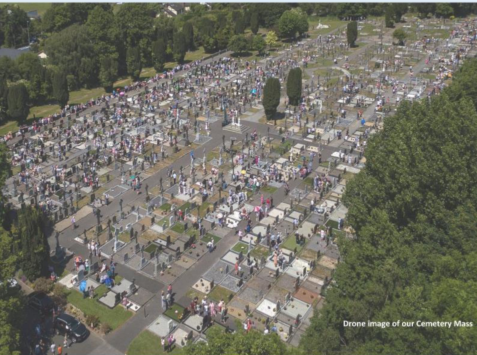
Drone image of our Cemetery Mass