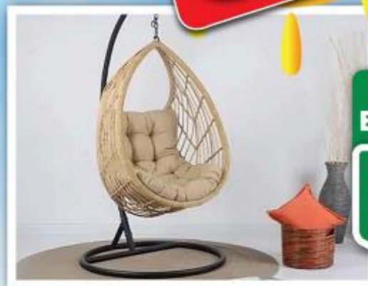
Single Egg Chair