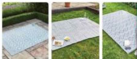
Outdoor Rugs 150x210cm