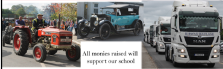
All monies raised will support our school

~Kids' Big Wheely Fun Run~Food~Refreshments~