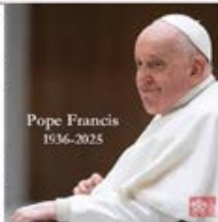
Pope Francis 1936-2025

Of course Jesus' door is a narrow one but not because it is a torture chamber. No, not for that reason! Rather, because he asks us to open our hearts to him, to recognise that we are sinners in need of his salvation, his forgiveness and his love in order to have the humility to accept his mercy and to let ourselves be renewed by him. Being Christian is living and witnessing to faith in prayer, in works of charity, in promoting justice, in doing good. The whole of our life must pass through the narrow door which is Christ.