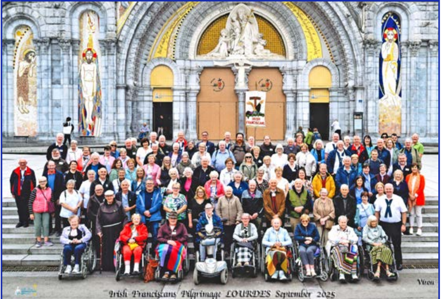
Irish Franciscans Pilgrimage LOURDES September 2025

if interested, Replies in the strictest of confidence.