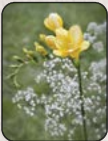
Dawn Clear Mill Court, Portlaoise

May They Rest In Peace Our Sympathies Are With Their Families